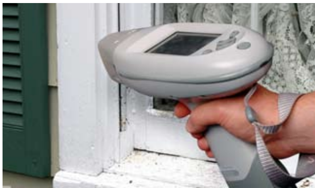
Unparalleled performance for residential lead inspection.