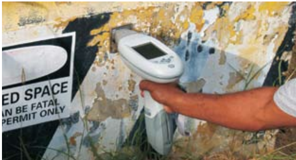
Industrial lead paint measurement for site assessment and worker protection.

In the outdoor environment, lead presents additional challenges. Whether the result of damaged exterior paint, residual contamination from leaded gasoline, a former pesticide application, or by-products from an industrial process, the sheer volume of samples required to accurately determine the extent of contamination and surgically delineate its boundaries demand the speed and accuracy of a Thermo Scientific Niton analyzer. The EPA recognizes this technology's advantage and has based its Method 6200 soil testing procedures on handheld XRF. "The result is a clearer delineation of how soil contamination differs from one part of the property to another." 3 When combined with optional Bluetooth™ communications and a portable GPS device, latitude, longitude, and elevation are stored along with the analysis data from each test, permitting real-time contamination mapping.